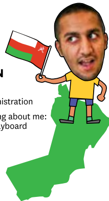
BADAR SULTAN OMAN